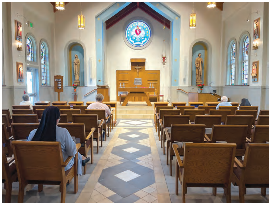
The sisters were able to use many of the items from the previous chapel in the newly designed chapel at Villa Maria by the Sea.