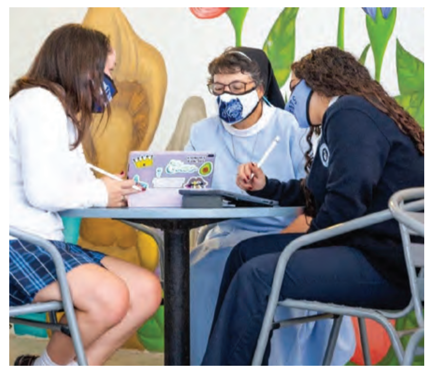
Sister works with students on their college applications as they prepare for their future after high school.