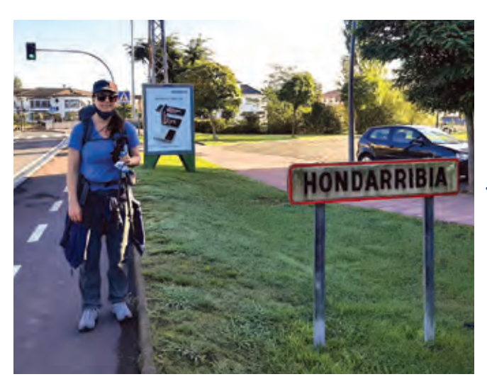
Let the journey begin!

pilgrimage to heal from my grief, but the timing never seemed right. As my Silver Jubilee in religious life approached in 2020, I felt the call to walk again, this time in thanksgiving for my vocation, my parents, and for my own personal intentions.