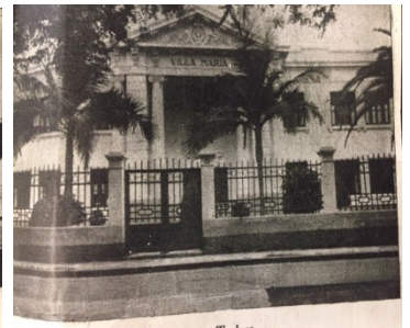
Villa Maria Today