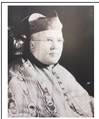
Dennis Cardinal Dougherty