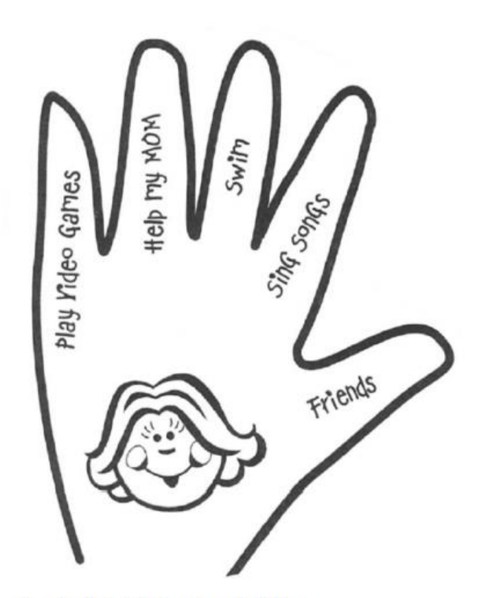
Sample of what the hand may look like

"Many hands make for light work"; have students talk about times at home or in school where this is true. When we all share our gifts and talents, everyone has what they need and the work gets done. Think about ways you can use your hands to help other people and spread the love of Jesus.