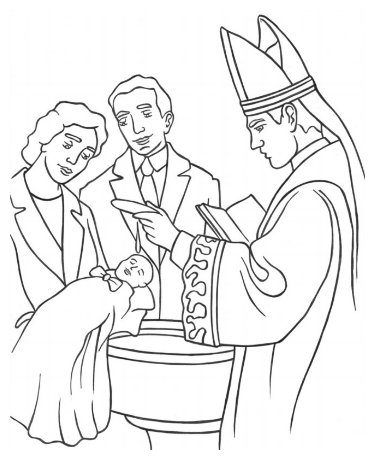
I baptize you, in the name of the Father, and of the Son, and of the Holy Spirit. Amen.