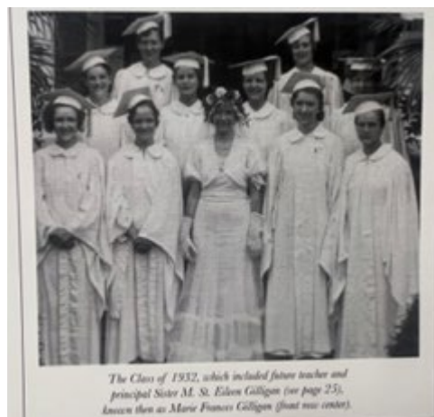
VMAHS Class of 1932

What prompts the beginning of a great endeavor? In speaking of Villa Maria Academy, the clear answer is two-fold -- the inspiration of the Holy Spirit and the dedication to the mission. Throughout the 150 years of the life of Villa Maria Academy, these two motivating forces have merged to provide the impetus and the momentum of every decision.