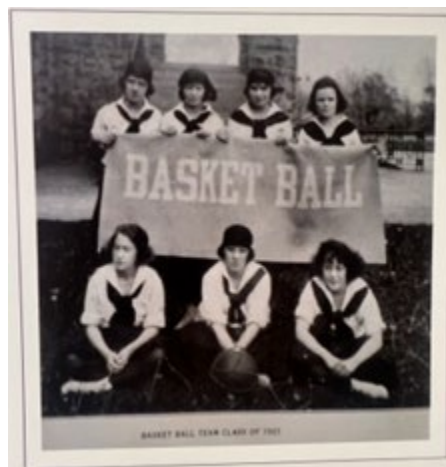
Basketball Team, Class of 1921