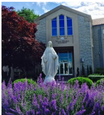
Villa Maria Academy LS