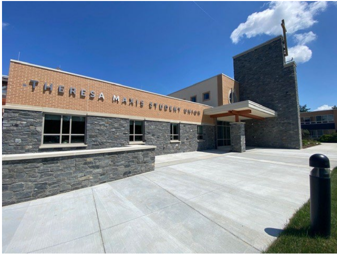
Theresa Maxis Student Union, VMAHS

Miraculously God provided an estate, located several miles to the east along Lincoln Highway at Green Tree. In May of 1925, Villa Maria Academy, Green Tree, opened for grades 1-8, with the high school students leaving Immaculata for Green Tree one year at a time.