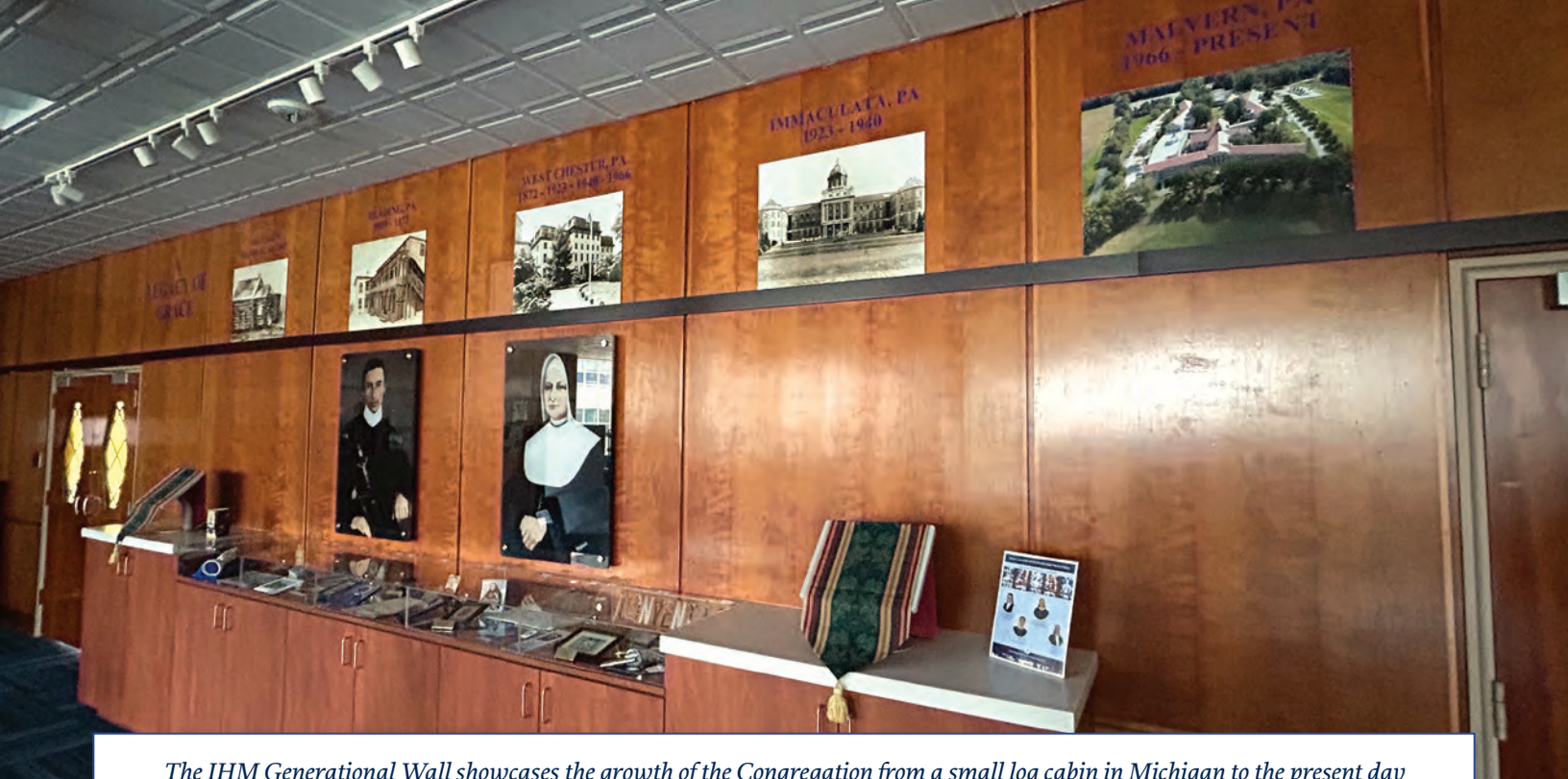
The IHM Generational Wall showcases the growth of the Congregation from a small log cabin in Michigan to the present day Motherhouse in Pennsylvania; the wall also pays tribute to Mothers General elected by the Congregation throughout the years.

tables were made – one for each branch of the IHM Congregation! Our table is proudly displayed in the Heritage Room."