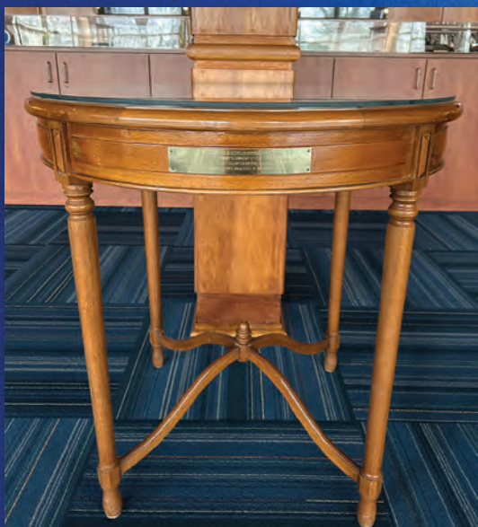
Table made from wood of the first convent

TO SCHEDULE A TOUR OF THE IHM HERITAGE ROOM CONTACT: