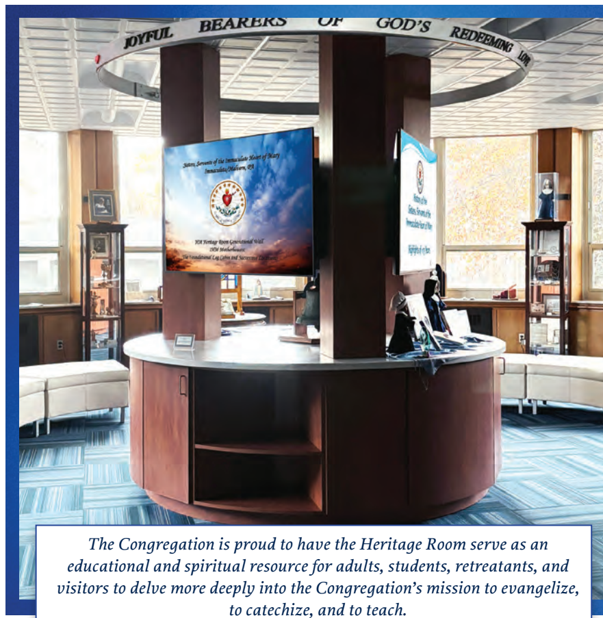
The Congregation is proud to have the Heritage Room serve as an educational and spiritual resource for adults, students, retreatants, and visitors to delve more deeply into the Congregation's mission to evangelize, to catechize, and to teach.