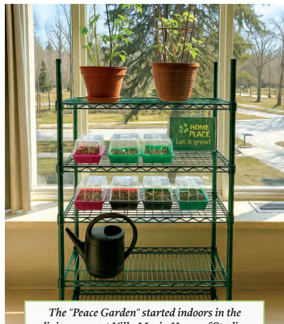
The "Peace Garden" started indoors in the dining room at Villa Maria House of Studies.

While the seedlings continued to grow indoors, construction began outdoors on seven raised garden beds placed in the courtyard on the Motherhouse grounds. Raised beds were selected because "they are good for drainage, offer better control of the soil, and are aesthetically appealing," Craig adds. The beds were