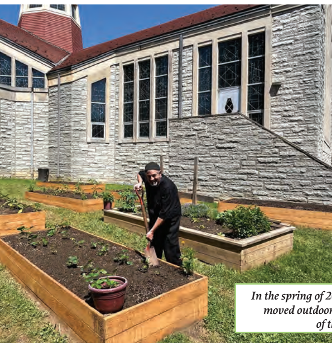
In the spring of 2024, the Peace Garden was officially moved outdoors to the courtyard on the grounds of the IHM Motherhouse.