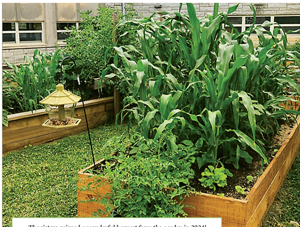
The sisters enjoyed a wonderful harvest from the garden in 2024!

May God continue to bless the Peace Garden, and may it be a source of nourishment – in body and in spirit.