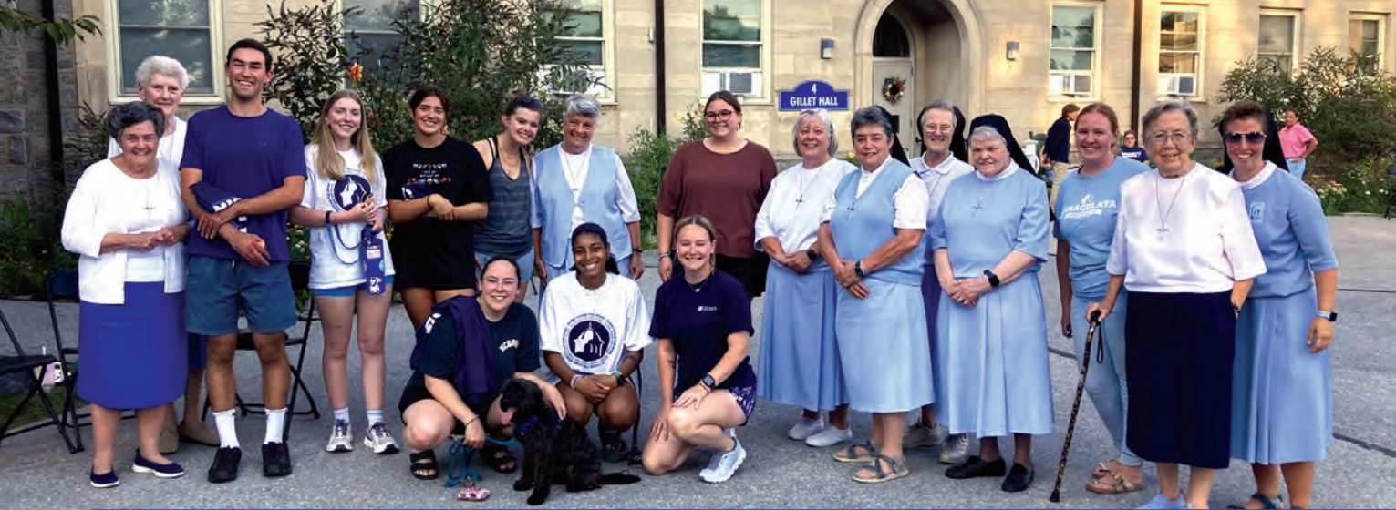
Students and sisters gather for the annual S'mores with the Sisters event held at the beginning of the fall semester. The event, run by Campus Ministry and Student Life, welcomes students back to campus and gives students and sisters the opportunity to connect with one another.