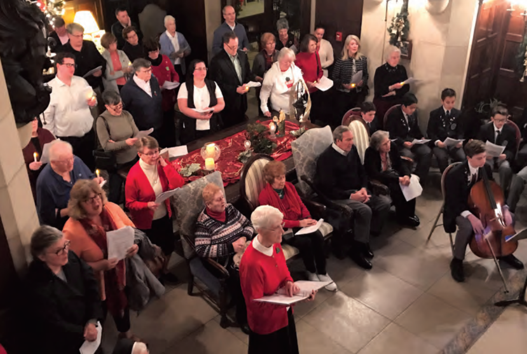
The annual Carol Night draws a big crowd. Bell choir, carols, and procession through the mansion draws everyone into the heart of the Christmas season.

Local places in need such as Mercy House, Dawn’s Place, the Family Literacy Center, and St. Agnes Day Room have all benefited from the generous donations graciously given over an afternoon of tea.