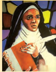
St. Teresa of Avila