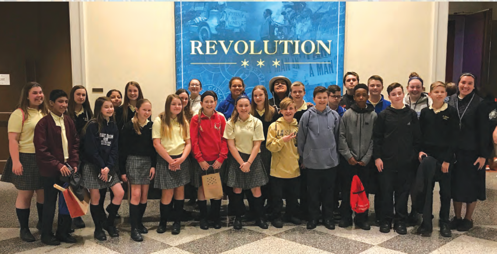
No classroom revolution -- simply a visit to the Museum of the American Revolution in Philadelphia.

Seventh and Eighth-Grade Teacher St. Ephrem School, Bensalem, PA