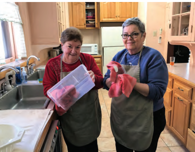
Volunteers make the day flow smoothly. They do it all – from greeting guests to doing dishes.