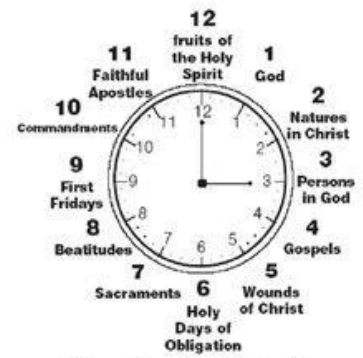
The Clock's Details